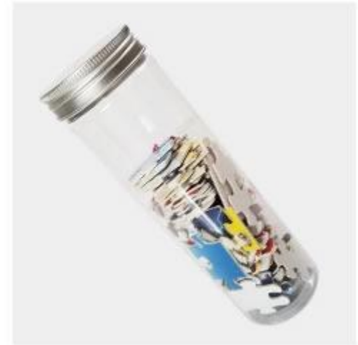
Custom plastic jar packaging