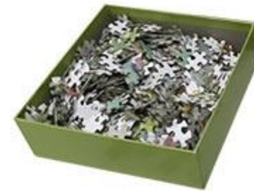
Custom frameless puzzle