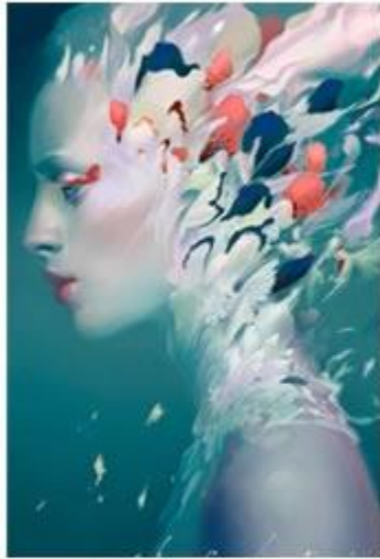
Providing a patterned