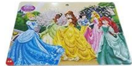
Custom frame puzzle