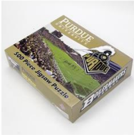
Paper packaging customization